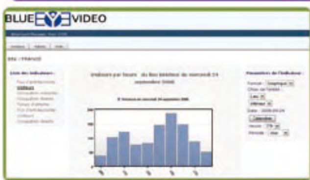
Screen shots from BlueCount Manager interface